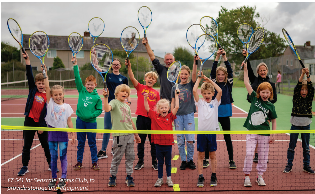
£7,541 for Seascale Tennis Club, to provide storage and equipment

Over £110,000 has been awarded in the latest round of Community Investment Funding.